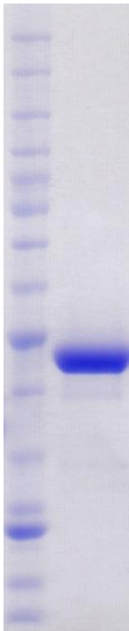
Coomassie blue-stained SDS-PAGE (4-12% acrylamide) of 4 \mu\text{g} of RBC CHD2-[CHR] (GST). MW markers (left) are, from top, 220, 160, 120, 100, 90, 80, 70, 60, 50 , 40, 30, 25, 20, 15, 10 kDa.

STORAGE: -70°C. Thaw quickly and store on ice before use. The remaining, unused, undiluted protein should be snap frozen, for example in a dry ice/ethanol bath or liquid nitrogen. Minimize freeze/thaws if possible, but very low volume aliquots (<5 \mu\text{l} ) or storage of diluted enzyme is not recommended.